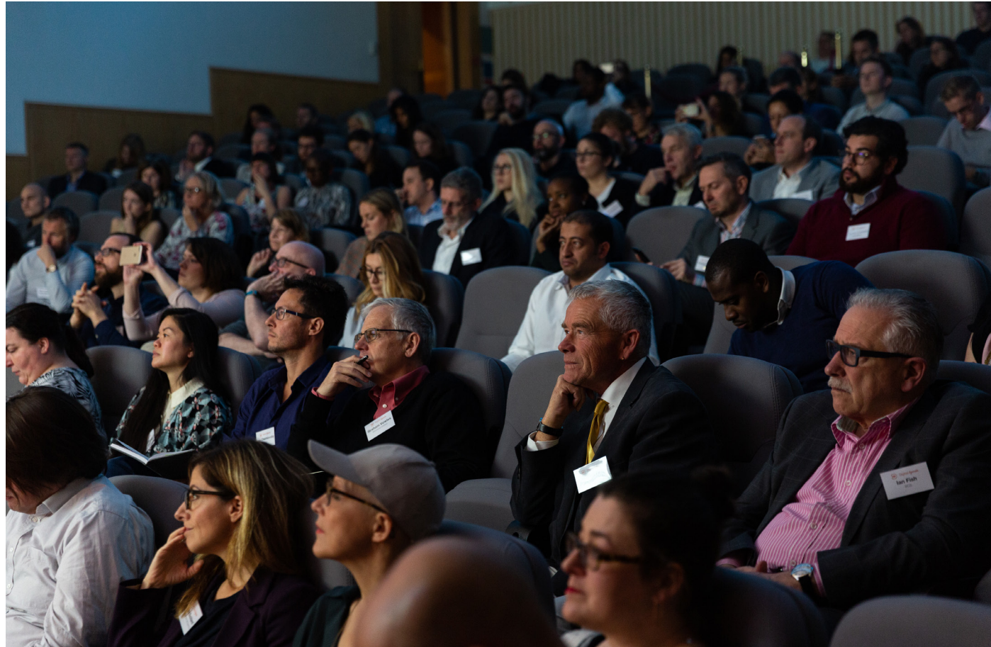
October 2018's Power & Responsibility Summit heard about digital's downsides

regards to affluent tech workers rubbing up against have-nots of the economic downturn), warnings of mass job losses to AI, frustration over perceived tax evasion by tech giants and the unaccountable power of Silicon Valley billionaires. Together with a growing unease that valuations within the industry may be overinflated and weariness over the next dotcom crash.