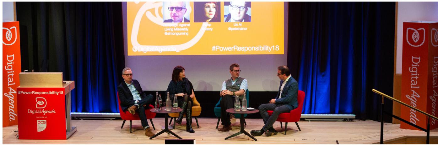
Discussion at the 2018 Power and Responsibility Summit

a $1tn valuation, with Amazon following suit and other big tech companies set to do the same. The advantages they have accrued are unfair and disallow future competition. These benefits include established user bases, deep knowledge of user behaviour, familiarity (users don't look elsewhere) and using wealth accumulated by dominating advertising revenue to fund the takeover of other market areas. All of this pales in comparison to the advantages they have by virtue of their vast datasets, in developing dominant AI and machine learning infrastructures that will consolidate their positions of power. We need to rethink anti-competition law and fair data ownership unless we want power to continue to rest, unchallenged, in the hands of a few giants.